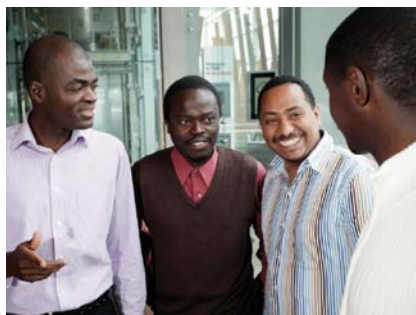
Participants catching up at NAB

“This dream is coming to life with the opportunity made available by the AAIP”